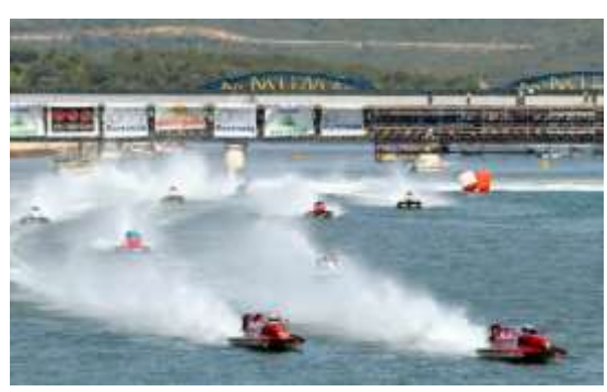
Img.5 - Arade River - Mouth