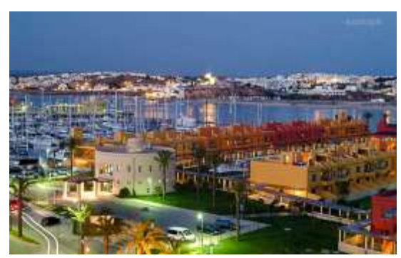
Img.7 - Portimão's Marina