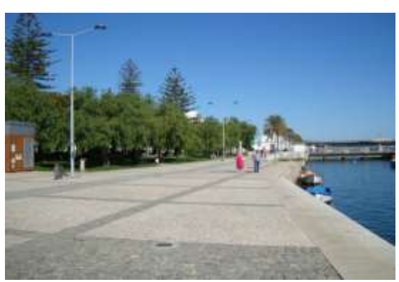
Img.11 - Arade River - Anchorage