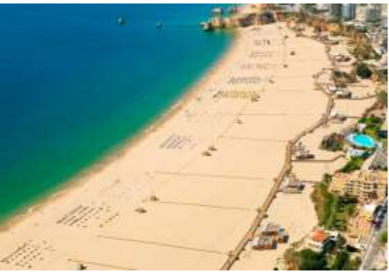
Img.1 - Alvor Beach