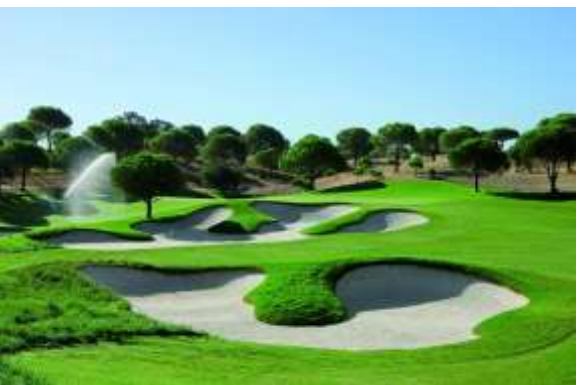
Img.3 - Penina Golf Course