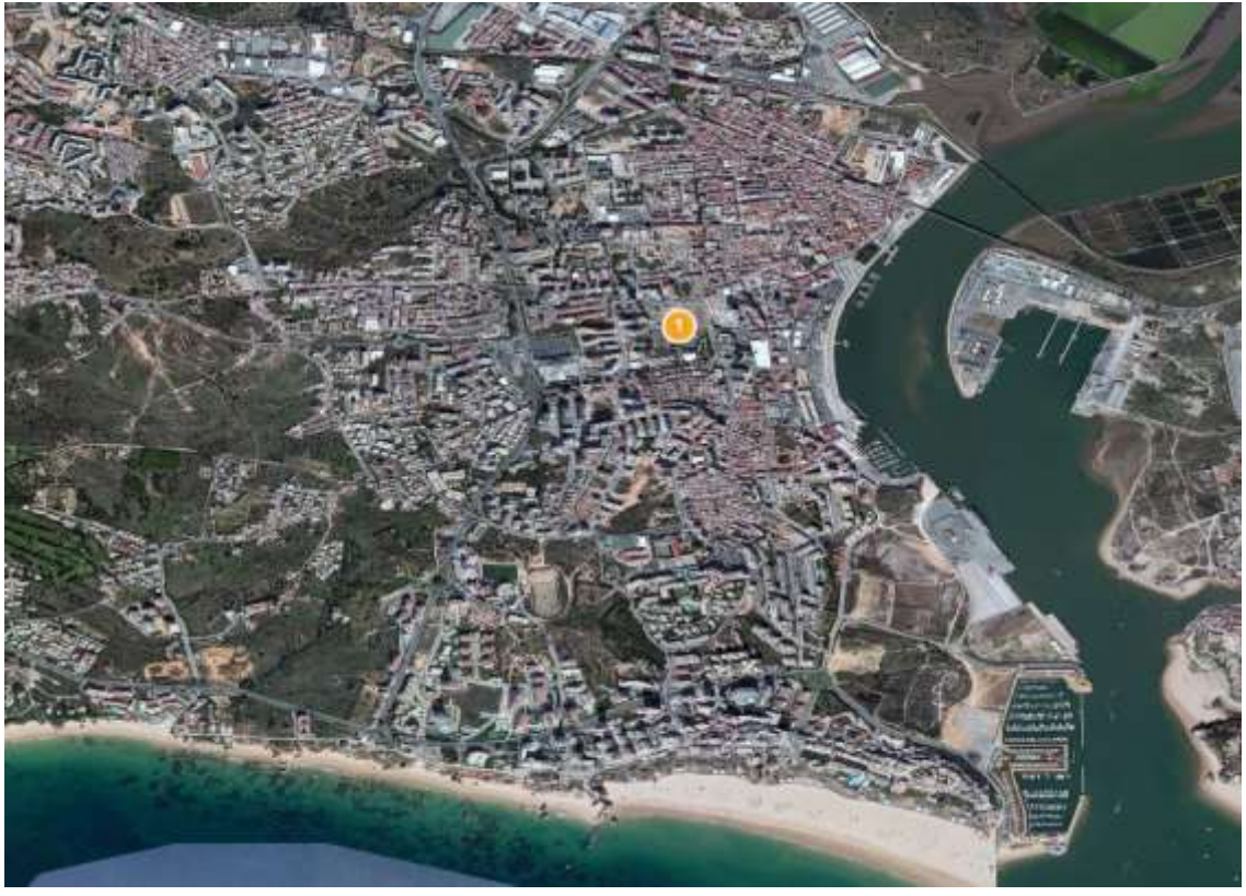
"IN CENTER" PROJECT