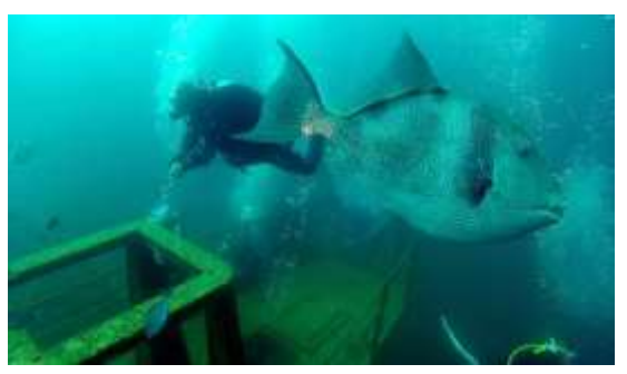
Img.10 - Ocean Revival Underwater Park