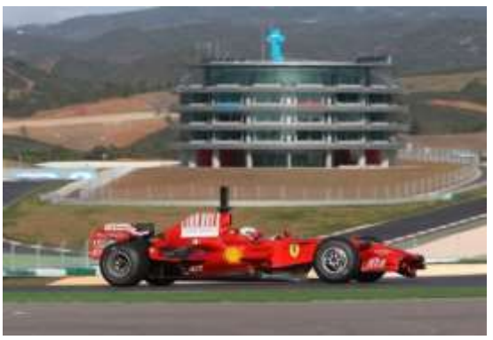
Img.13 - Algarve International Racing Circuit